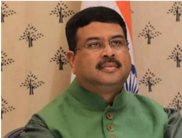
Union Education Minister Dharmendra Pradhan.

BHUBANESWAR: The National Education Policy (NEP) launched by the Modi government will transform the higher educational institutions into world-class centres, said Union Education Minister Dharmendra Pradhan on Friday in state capital Bhubaneswar.